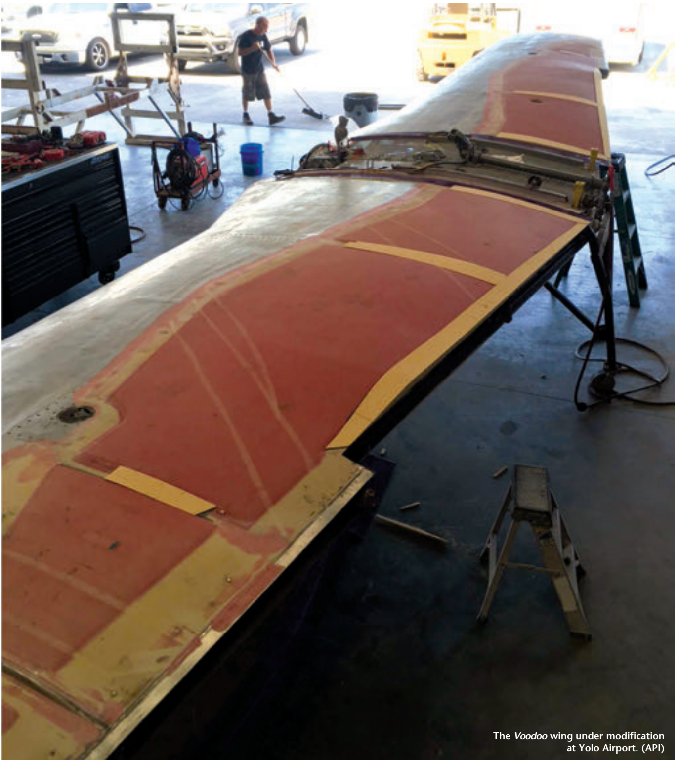
The Voodoo wing under modification at Yolo Airport. (API)

tanks. The increased wing depth moved the point of maximum thickness further forward thus compromising the potential high-speed performance of the original airfoil design by introducing strong local shockwaves.