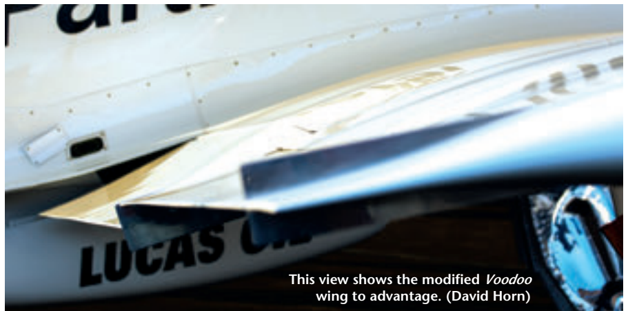
This view shows the modified Voodoo wing to advantage.